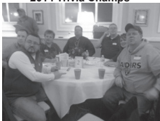
2014 Trivia Champs

Invite friends to join your team or we can place you with a team