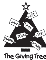
The Giving Tree