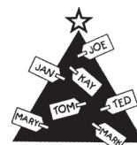
The Giving Tree