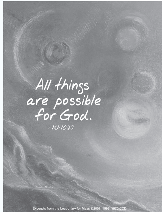
Excerpts from the Lectionary for Mass ©2001, 1998, 1970 CCD.

Marriage Engaged couples must meet with the Pastor to complete initial marriage paperwork at least 9 months before the anticipated wedding date and prior to making any other arrangements concerning the wedding. No date may be considered reserved until initial meeting and necessary paperwork have been completed. Call the parish office for an appointment.