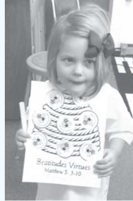
Making a "Bee Attitudes" Beehive