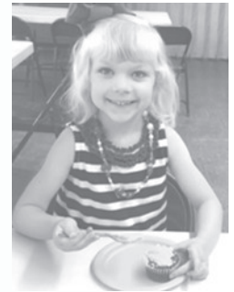
Enjoying a Snack