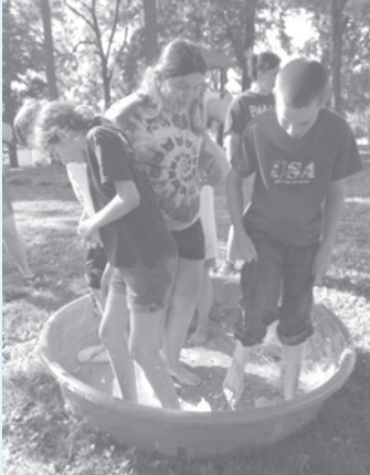
Smashing Grapes to Make Wine (Wedding at Cana)

512 North Perkins Street ✘ Rushville ✘ Indiana ✘ 46173 Parish: 765-932-2588 ✘ School: 765-932-3639 ✘ www.stmaryrush.org