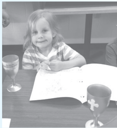
Making Chalice (Institution of the Eucharist)